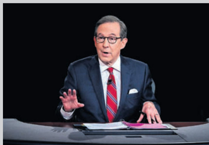
Moderator Chris Wallace speaks as President Donald Trump and Democratic presidential candidate former Vice President Joe Biden participate in the first presidential debate in Cleveland on Sept. 29, 2020.